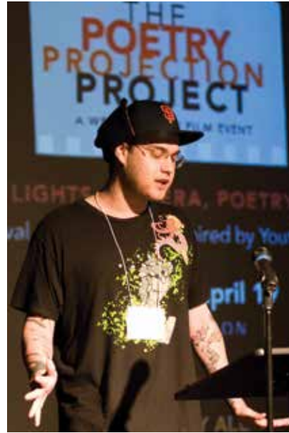
A participant in the WritersCorps Project Apr. 13 at YBC.