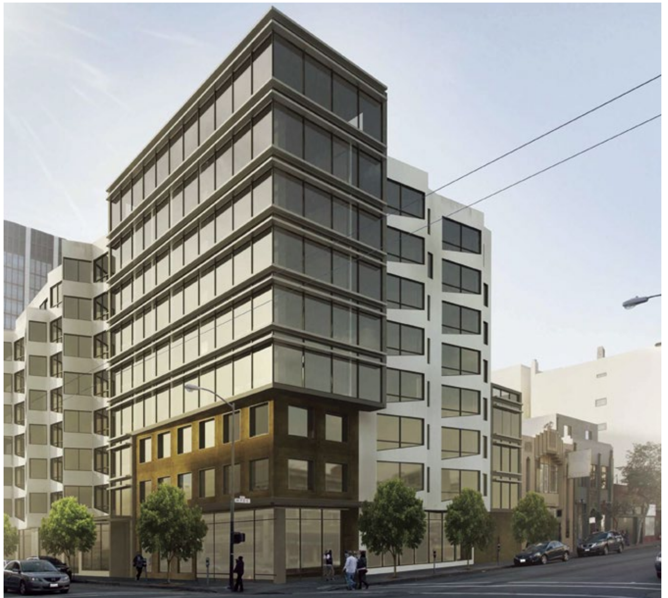
COSTA BROWN ARCHITECTS