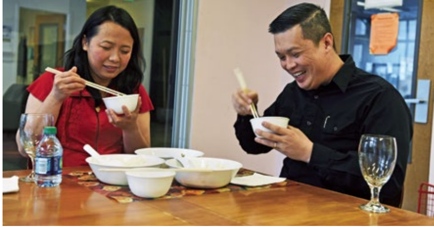
The Nguyens don't always dine out. They can stay at home and enjoy a traditional Vietnamese meal in the Curran House dining room.