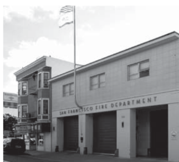
Station #36 on Oak Street at Franklin. Protect safety in your community by saving your neighborhood firehouse.

A 2005 study by the San Francisco Fire Department concluded that response times were slower in 22 of 24 areas of the city where fire stations were “browned out.” Longer response times put our neighborhood safety at risk — the faster the response time to emergencies, the greater the chance of saving lives and preventing damage.